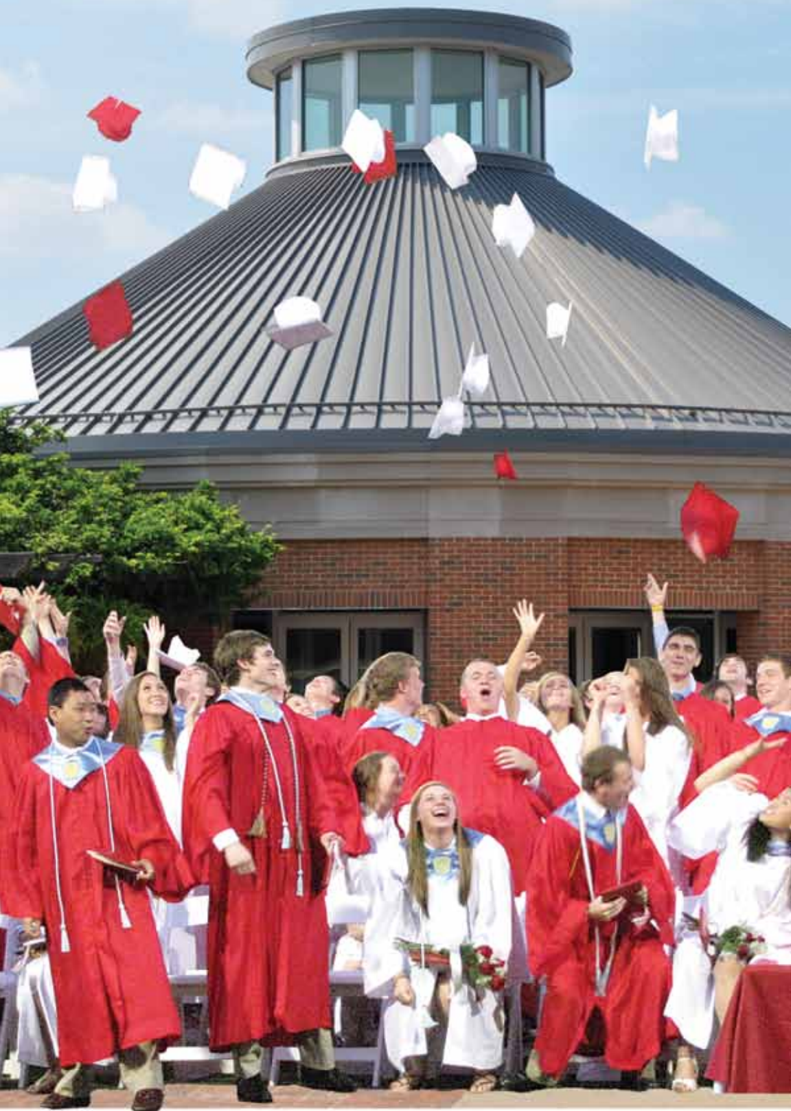
INDIAN HILL EXEMPTED VILLAGE SCHOOL DISTRICT CLASS OF 2011